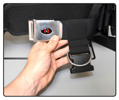
Fig. 11 Fig. 12 Fig. 13