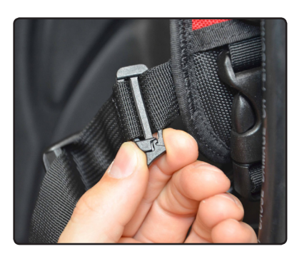
Fig. 6 Fig. 7 Fig. 8